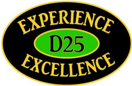
Table Topics & International Speech Contests