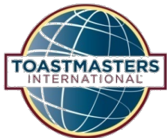
Table Topics AND International Speech SPRING CONTEST