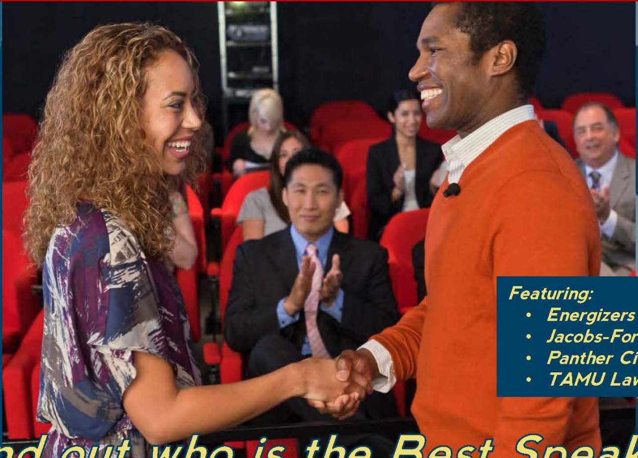
TABLE TOPICS AND INTERNATIONAL SPEECH CONTESTS