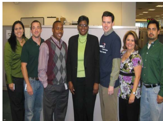
Toasting for Excellence (Capital One)