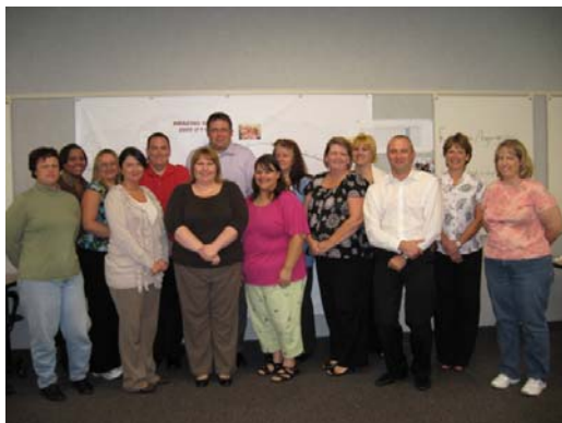
Speak Easys (Paychex)