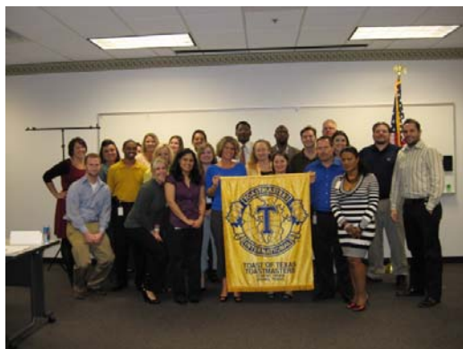
Toast of Texas (University of Phoenix)