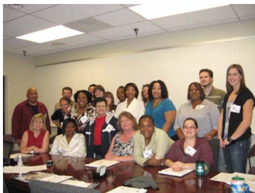
WINS Texas Toast (McGraw-Hill)