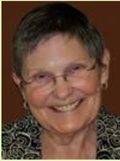
Awards Banquet: An Evening to Remember