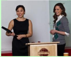
The Importance of Intros