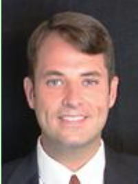
15 Strategies to Gain and Retain Members

COME ONE, COME ALL! to the "Greatest Show on Earth!"