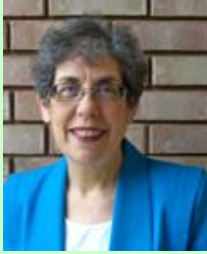
Dues are Due